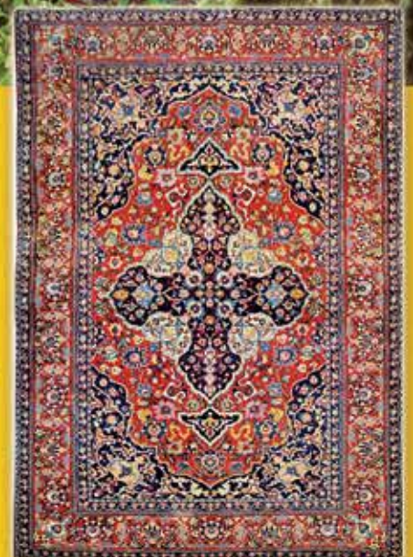
Mid 19th Century Isfahan Origin : Iran