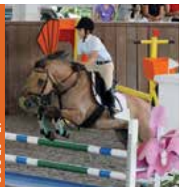
OCT 26 - 27 Riding - Autumn Jumping Festival