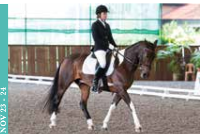
NOV 23 - 24 Riding - Thanksgiving Show