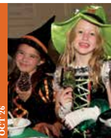
OCT 26 Children's Halloween Party