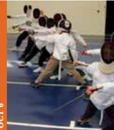
OCT 6 Sports - Modern Fencing for Kids