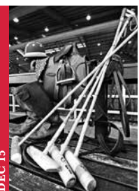
DEC 15 End of Polo Season