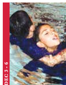
DEC 3 - 6 Sports - Water Skills & Lifesaving Lessons