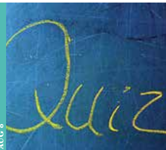
AUG 8 Quiz Night