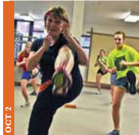
OCT 2 Sports - Cardio Kickboxing for Ladies

DON'T MISS THE EXCITING LINE-UP OF EVENTS & ACTIVITIES FROM OCTOBER TO DECEMBER!