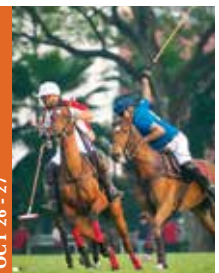
OCT 26 - 27 Polo - Novice Tournament