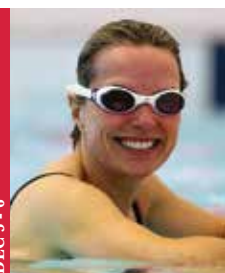
DEC 3 - 6 Sports - Learn to Swim Programme (Crash Course)