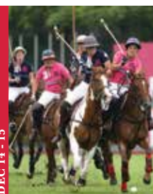
DEC 14 - 15 Polo - Battle of the Sexes