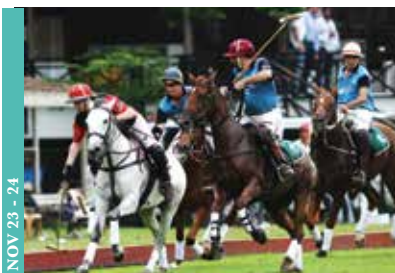
NOV 23 - 24 Polo - Club Tournament - Victor's Cup