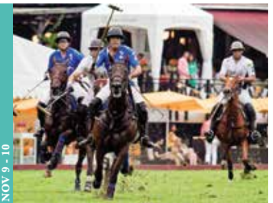
NOV 9 - 10 Polo - Club Tournament - Beaujolais Cup