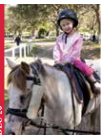
DEC 26 Riding - Amazing Race