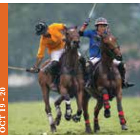
OCT 19 - 20 Polo - Club Tournament - Ismail Cup (Senior)