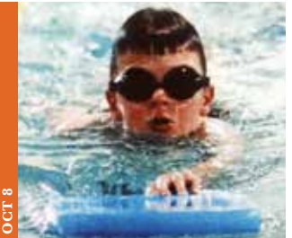
OCT 8 Sports - Junior Swimmers Survival Programme