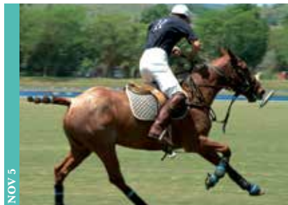
NOV 5 Park Regis Melbourne Cup