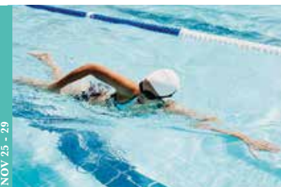
NOV 25 - 29 Sports - Survival Swimming / Long Distance Swimming Test