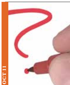
OCT 11 Quiz Night