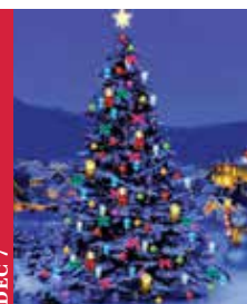
DEC 7 Christmas Light Up