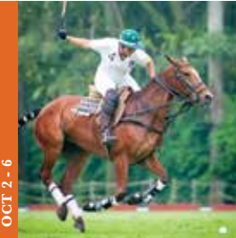
OCT 2 - 6 Polo - Standard Chartered Ladies' International